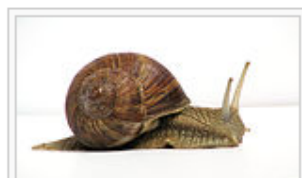
A decomposed snail in Scotland was the humble beginning of the modern law of negligence

See also: Negligence and Professional negligence